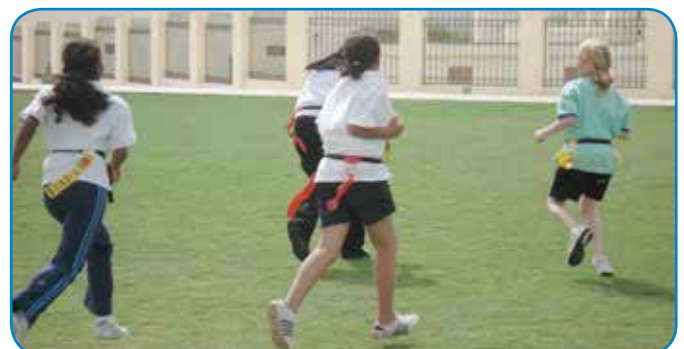
Figure 2 Students wearing flag belts.

The simple replacement of tackling with the use of flag belts (Figure 2) plays a key role in maximising all four aspects.