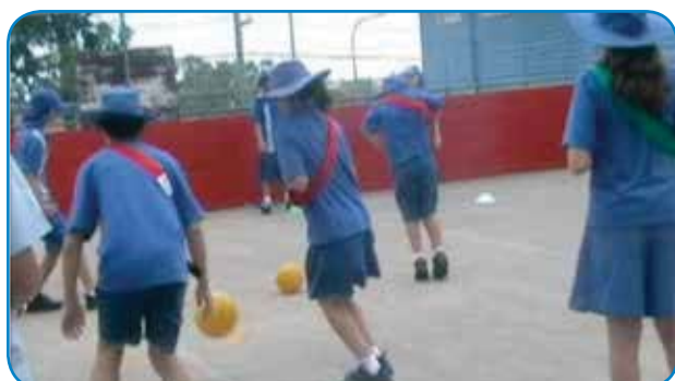
Figure 3 Dodgers evading the poison balls.