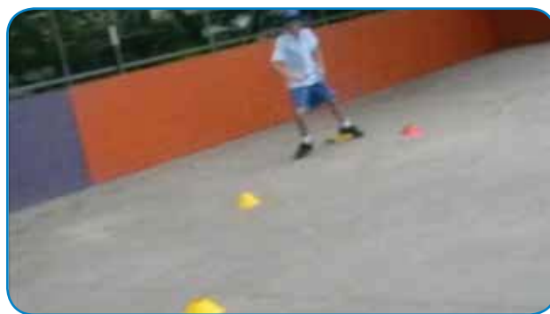
Figure 4 Flexible field markers.