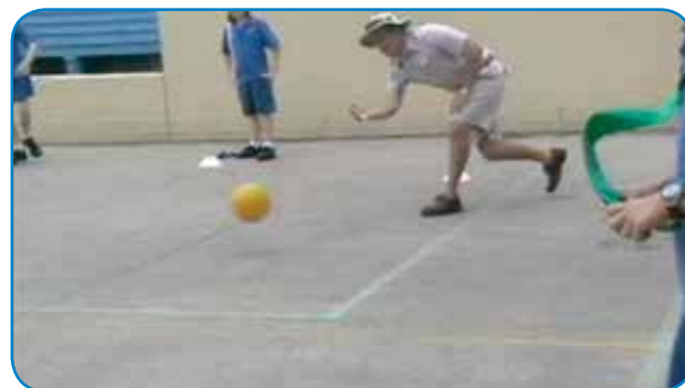
Figure 5 Ball must be rolled.