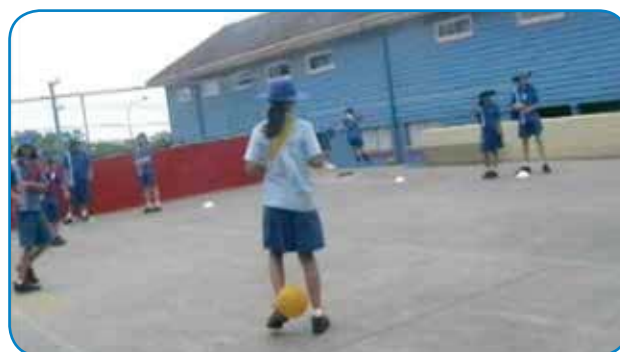
Figure 6 A successful hit – below the knees.